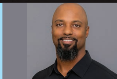
Preparing for the New Year