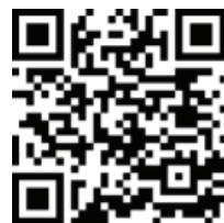
SCAN FOR APP

Stay connected by downloading the IBEW Local 11 App , where you'll find important updates, news, and resources—all at