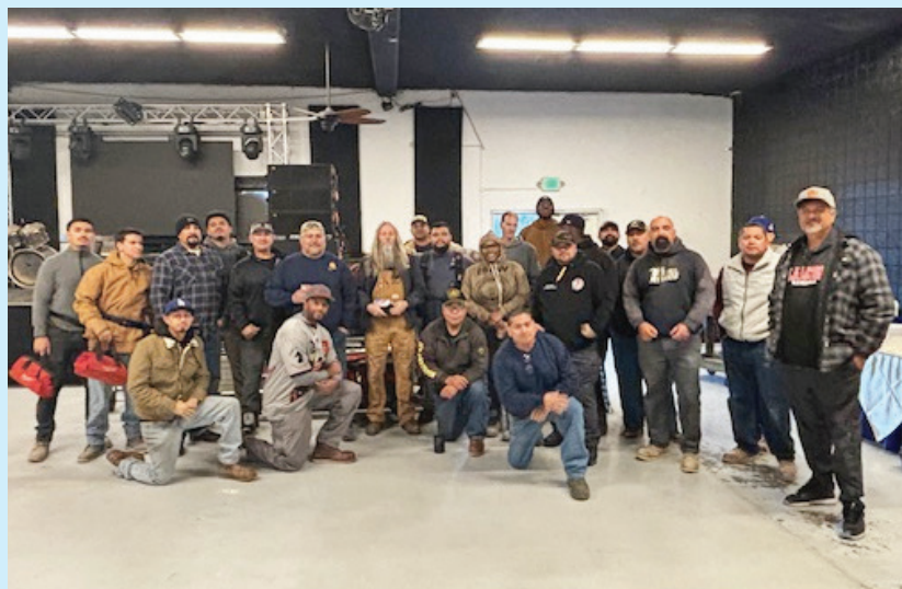
IBEW Local 11 members participating in a Veterans Day project at the VFW Post in Azusa. BEW Local 11 members are participating in a Veterans Day project at the VFW Post in Azusa.