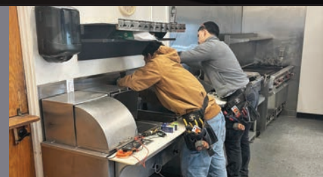
Making a difference on Veterans Day