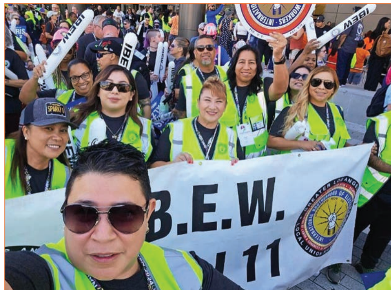
IBEW Local 11 sent delegates to the 2024 IBEW Women's and NABTU Tradeswomen's Conferences. The IBEW conference had over 800 in attendance, which is the most to date. The NABTU conference had more than 5,000 in attendance and Local 11 was well represented.