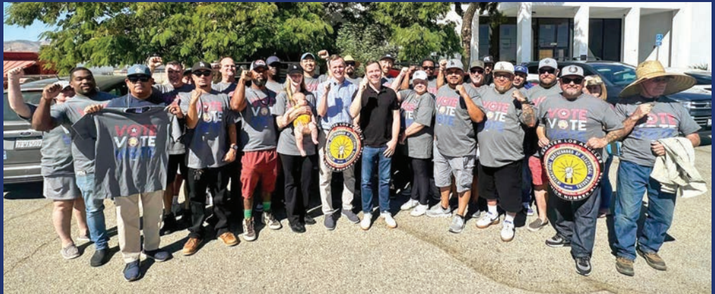
Volunteers gathered to knock on doors in support of George Whitesides.