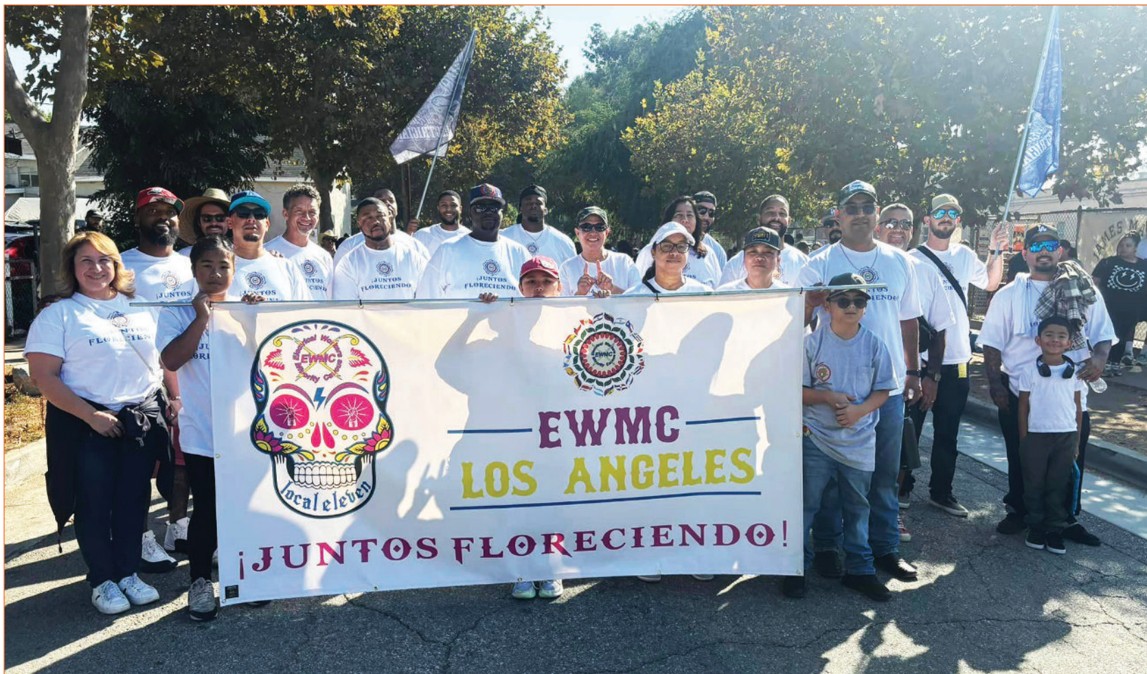
In celebration of Hispanic Heritage Month, IBEW Local 11 EWMC Chapter members and family marched in the annual Latin American Parade in the city of Pasadena.